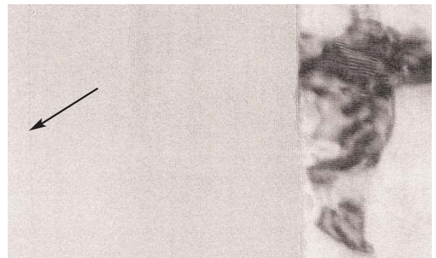
The TEM view of an ultra microtome section of the sample shows the narrow band and the uniform film structure.

lished, mirror-finished, high purity aluminium, anodised at a constant current density of 5 \text{ mA cm}^{-2} at 20 C in 0.1\text{M Na}_2\text{CrO}_4 solution to 120 V, then rinsed in distilled water and warm air dried. The film is amorphous and highly uniform in thickness and microscopically flat. Inside the film, 19 nm from the surface, is an extremely narrow dark band about 2-3 nm thick. This band contains about 10 at. % \text{Cr}_2\text{O}_3 .