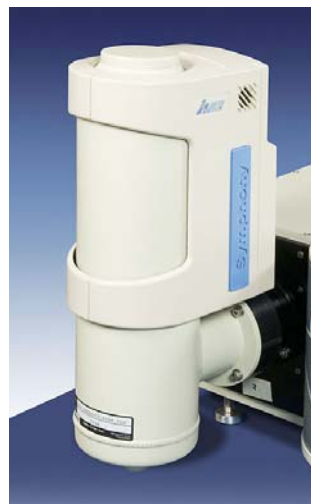
Figure 2. Symphony InGaAs array, the standard detector on the NanoLog™.

at 1200 nm) for emission. To detect the nanotubes' fluorescence, a Symphony-series near-IR InGaAs CCD-array (512 pixels × 1" [2.54 cm], liquid-N 2 cooled) was used, with 2 s integration time per emission scan. The slit-width was 4 mm on both excitation and emission. The step size was 2 nm between points for each scan. Excitation was scanned from 620–815 nm; emission was scanned from 1080–1356 nm. Photoluminescence intensity was measured as (signal – dark counts)/reference. The total acquisition time for the data was about 10 min.