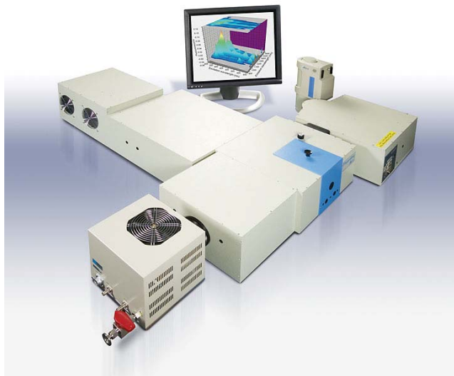
Figure 1. NanoLog™ spectrofluorometer from HORIBA Jobin Yvon.

Single-wall carbon nanotubes (SWNTs), consisting of rolled-up single sheets of carbon atoms, have received much attention recently. SWNTs are known to emit in the IR region, and their emission can be used to characterize their diameter and other structural properties. The NanoLog™ (Fig. 1), the modular spectrofluorometer from HORIBA Jobin Yvon, is designed with near-IR detectors and a TRIAX spectrometer for efficient spectral analysis of SWNT emission. Near-IR detectors available include both liquid-N 2 -cooled Symphony series of InGaAs arrays (Fig. 2), which can take a full spectrum rapidly, as well as economical single-element InGaAs detectors. These detectors are sensitive to photons from 800–1700 nm, with optional detection to longer wavelengths. In addition, for extra sensitivity and time-resolved measurements, a near-IR-sensitive photomultiplier-tube may be used as the detector.